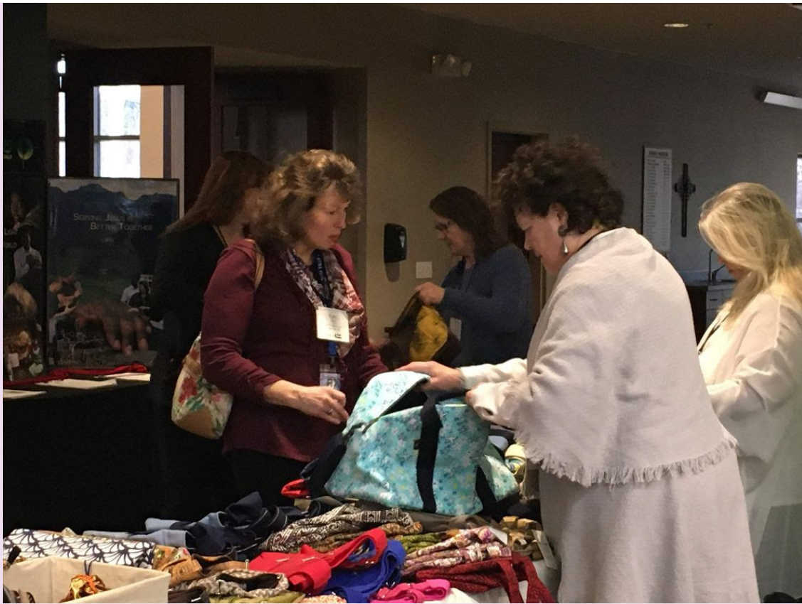
The Market Place was full of wonderful stories and merchandise.