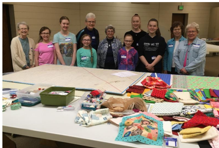
Seminars - Break Out Sessions