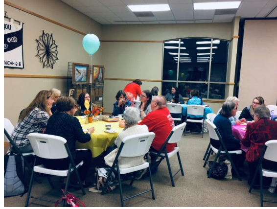
Pre-Conference Sewing Workshop